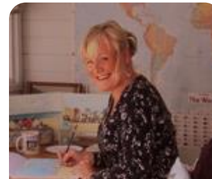
Painting by Lynette Amelie Beach Huts